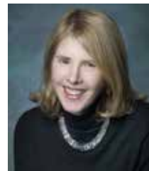
KAY JAMISON, PHD

The Meet the Speaker reception and book signing will immediately follow from 5:00 - 7:00 pm. This year's event focuses on brain health and features renowned psychologist, educator and author Kay Redfield Jamison, PhD, as keynote speaker. The VIP Wine Dinner includes an opportunity to dine intimately with Dr. Jamison the evening before at 6:00 pm at the Conservancy of Southwest Florida.