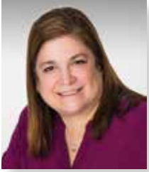
By Elena Zerpa, MD Staff Psychiatrist

Suicide is the second most common cause of death among today's college students. A growing number of students have significant psychological problems, with increased levels of stress, depression and anxiety.