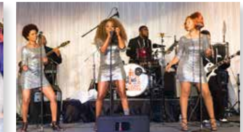
BIG SWING AND THE BALLROOM BLASTERS