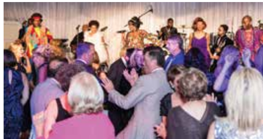
GUESTS DANCING THE NIGHT AWAY