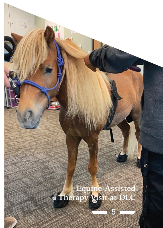
Equine-Assisted Therapy Visit at DLC

94% Children's PHP clients discharged with no readmissions after 180 days over the last three years